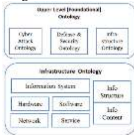
Figure 1. Upper Level and Lower Level Infrastructure Ontology.

Cyber Ontology for Countering Attacks. The top levels are illustrated in Figures 1 and 2.